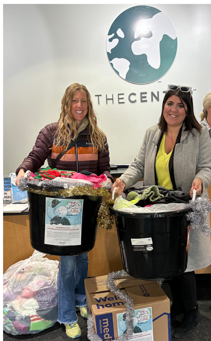
(LEFT) In the winter of 2023 the YAP class organized a fundraiser along with Broadway Utica's Community Outreach & Program Coordinator to collect winter hats, mittens and gloves. All collected items were handed over the THE CENTER in Utica.

There is no cost to accepted students, the entire program is funded by area businesses. The Bank of Utica has been one of its biggest supporters for over ten years. It's a commitment such as theirs that provides the growing success of the Youth Ambassador Program.