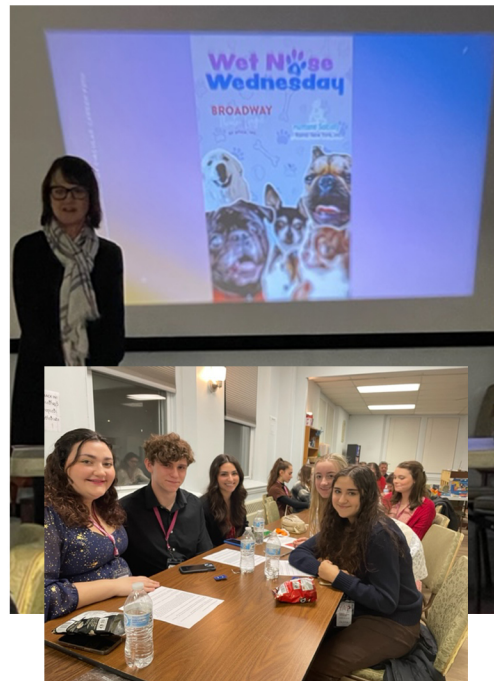
(RIGHT) is an example of a Pre-Talk, all students gather on opening night of a show and are addressed by cast, crew and/or community member.